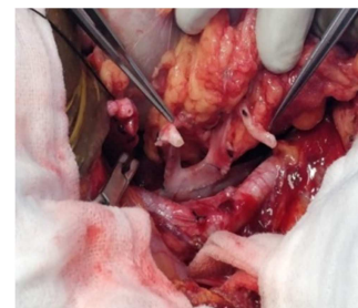
(a) vein anastomosis completed